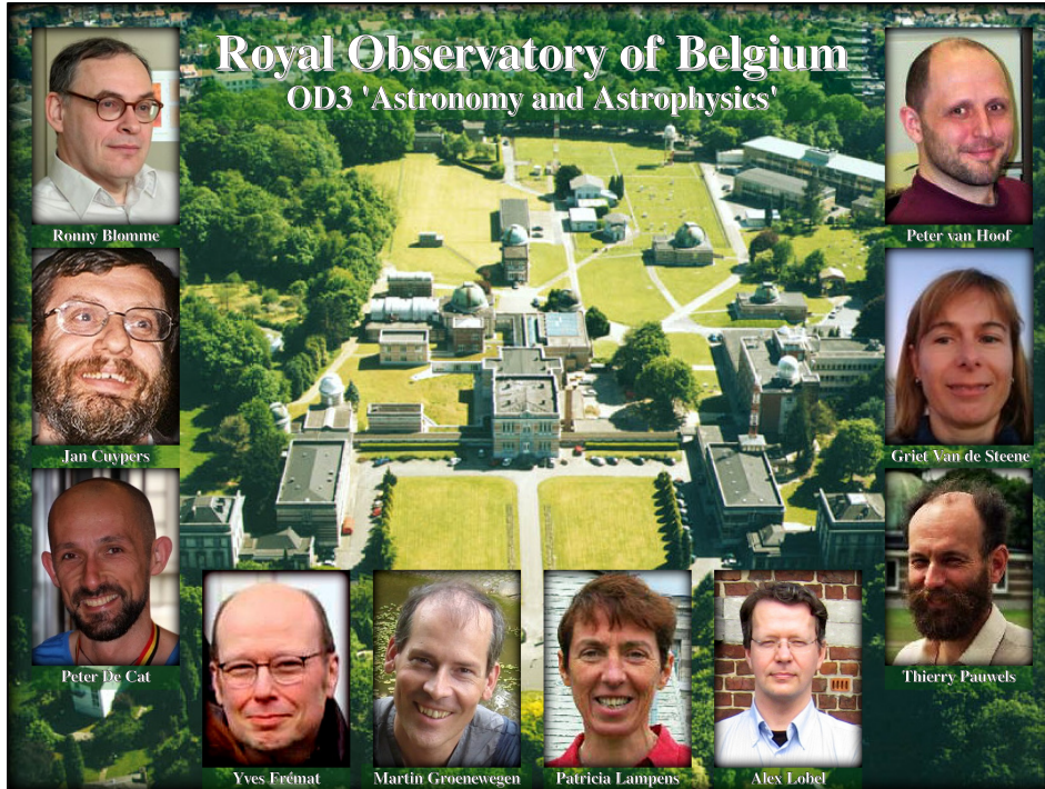
Figure 1: Presentation of the department “Astronomy and Astrophysics” (OD3) of the Royal Observatory of Belgium. Pictures of the staff and post-doctoral researchers are given on top of a view on the site where the Royal Observatory of Belgium is located (Ringlaan 3, 1180 Brussels, Belgium).

sky; photometry: broadband Johnson-Cousins U, B, V, R, I + u, g, r, i, z SDSS filters),