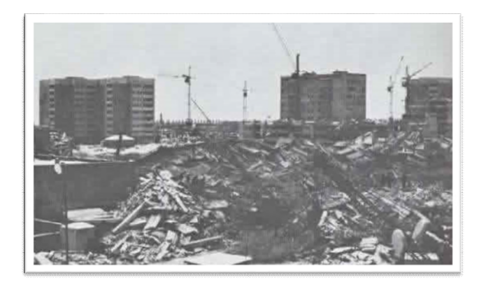
Fig. 4. Large-panel concrete buildings remained undamaged in 1988 in Armenia