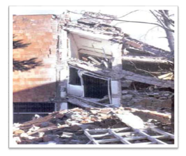
Fig. 3. Building collapse in the 1988 in Armenia

There is a general concern among the quake designing group regarding to the seismic execution of prefabrication construction. Taking into account involvement in past seismic tremors in Eastern European and in Central Asian nations where these frameworks have been generally utilized, it can be presumed that their seismic execution has been genuinely palatable. Be that as it may, in terms of seismic tremor execution, the truth of the matter is that "terrible news" is more generally announced than "uplifting news." For example, the poor performance of precast frame systems of Seria 111 in the 1988 in Armenia earthquake is well known (Fig. 3). However, few designers are aware of the good seismic performance (no damage) of several large-panel buildings under construction at the same site (Fig. 4).