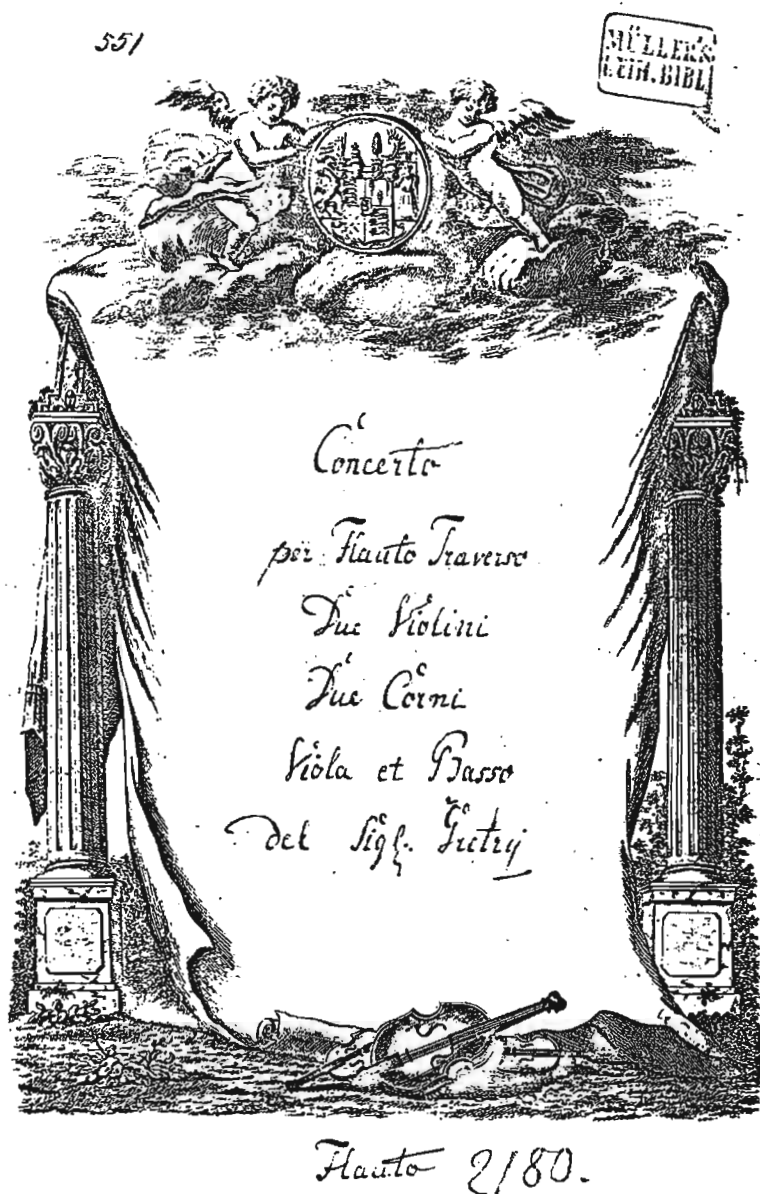
FIGURE 1 : Cover of folder (containing manuscript flute part of Grétry's flute concerto) showing engraved coat of arms of Franz Karl Eusebius (Washington, Library of Congress)