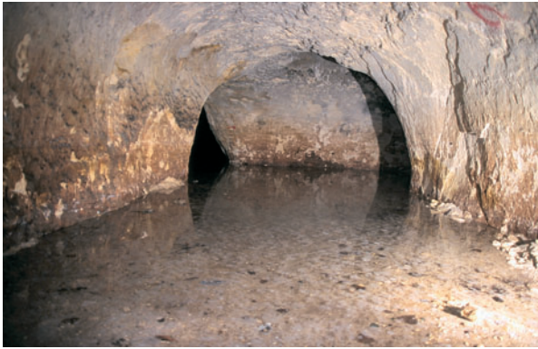
Figure 4: Underground quarry in Meerssen calcarenitic limestone, extracted as soil conditioner, resulting in arched sections. Waterkuil, Vechmaal.

Kanne Horizon, form the sufficiently solid roof for the excavations (Fig. 3). The building stone was dispatched to the southern part of the County of Borgloon (coinciding with the central-southern part of the actual province of Belgian Limbourg), as could be derived from the occurrences of the typical tauw facies among the building stones recorded in monuments. From this same origin, but corroborated by historical documents, most quarrying for building stone must have taken place in the late 13th to 16th centuries. The coarser-grained and irregularly lithified Meerssen Limestone and the lower, flint-bearing part of the Nekum Limestone served as soil conditioner and fertiliser. Galleries carved out in these levels present an arched section (Fig. 4).