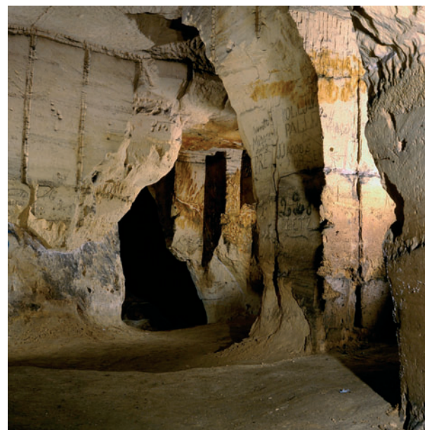
Figure 3: Underground quarry in Nekum calcarenitic limestone, extracted for 'maastrichtsteen' building stone, resulting in rectangular sections. Grote Kuil, Vechmaal.

Only the upper part of the Nekum Limestone was suitable for quarrying the regionally important 'mergelsteen' or 'Maastrichtersteen' building stone (Dreesen et al., 2002). Galleries in this stratigraphic level show sawed walls and rectangular sections, becoming parabolic where lithostatic pressure approximated the mechanical strength of the roof, i.e. where the thickness of Cretaceous calcarenites overlying the excavation is reduced to metric scale or even less. The base of the Caster Hardground, occasionally the