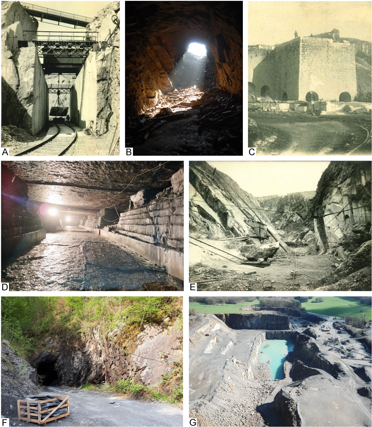
Figure 3. The past and ongoing stone industry in the Devonian of southern Belgium. A. Hautmont marbre rouge quarry, Vodelée, 1929 (courtesy of Pierres et Marbres de Wallonie). B. Wierde ironstone mine, active between 1855 and 1869. C. Lime kiln at Jemelle, early 20th century (courtesy of Pierres et Marbres de Wallonie). D. Mazy marbre noir underground quarry at Mazy, the only underground ‘marble’ quarry still ongoing nowadays in Belgium. E. Marbre Sainte-Anne quarry at Gournies, 1920s (courtesy of Pierres et Marbres de Wallonie). F. Entrance of the Alle slate underground quarry. G. Aerial view of the Marenne quarry, extracting Givetian limestone for aggregate production, 2023 (courtesy of Jean-Marc Marion).