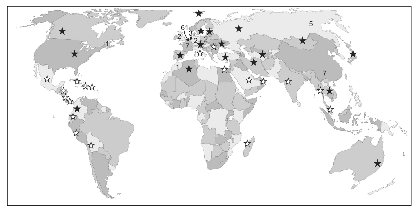
Figure 1. World Map of Edouard Poty's publications and collections. Cyphers indicate the number of publications for each country. Black stars stand for Palaeozoic corals from Eddy's collection. White stars stand for other corals from his collection.

field geologist who enjoys describing, measuring and sampling sections. Very few outcrops escaped to his hammer in Belgium and abroad. Step by step and country after country, he gathered what was going to be one of the largest - if not the largest collection of Carboniferous corals worldwide with more than 20 heavy cubic-metres of hand-specimens and 30,000 thin sections (and an unknown number of unclassified ones) from more than 60 regions (Fig. 1), each sample localized and stratigraphically positioned. Hundreds of those samples are rare specimens or specimens from localities that are no longer accessible and thus making this collection even more valuable. Thanks to many worldwide collaborations - several being running for more than 40 years on - Eddy gathered an incredible knowledge on the Carboniferous of the world. In 2015, his research on corals was rewarded by the highest prize in this field: the Henry Milne Edwards Medals from the Association for the Study of Fossil Cnidaria and Porifera.