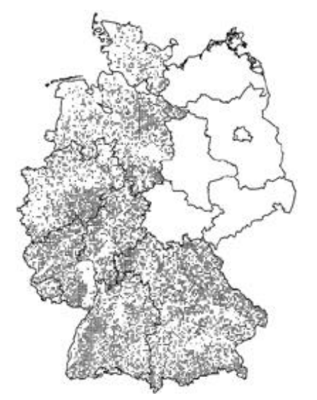
Figure 1. Map of the Bundeswaldinventur (BWI) grid.

Explanatory notes to table3 = FCCC/SBSTA/2000/misc, 6 (on line at: <http://www.unfccc.de>); o.b. = over bark;u.b. = under bark.