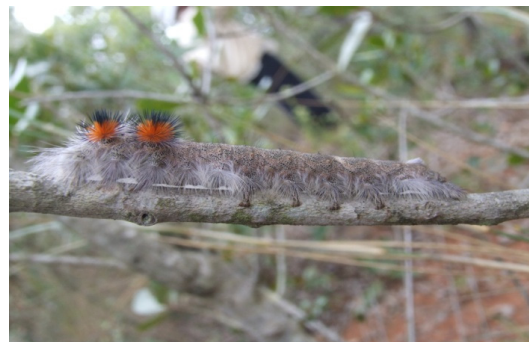
Figure 2. Borocera cajani larvae in 5 th instar — Larve de stade 5 de Borocera cajani .

Borocera cajani colonizes the U. bojeri (or “Tapia”) forest, which is found in the central highland