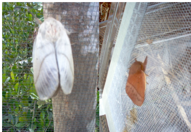
Figure 1. Borocera cajani moths (left: female, right: male) — Papillon de Borocera cajani (à gauche : femelle, à droite : mâle).

Females are much larger; with a body size about three times that of the male. Their wingspan is about 70-75 mm, with a forewing length of 35 mm. The antennal shaft is black, with yellow pectination. These moths are hairy, with a thick bodied, grayish yellow tinted, bare thorax, and legs of the same color as the forewings. The hairy legs terminate in black tarsi. The wings are a dirty white to pale grey, silky, and shiny (De Lajonquière, 1972; Razafindraleva, 2001). The forewings are crossed by two transverse lines that spilt