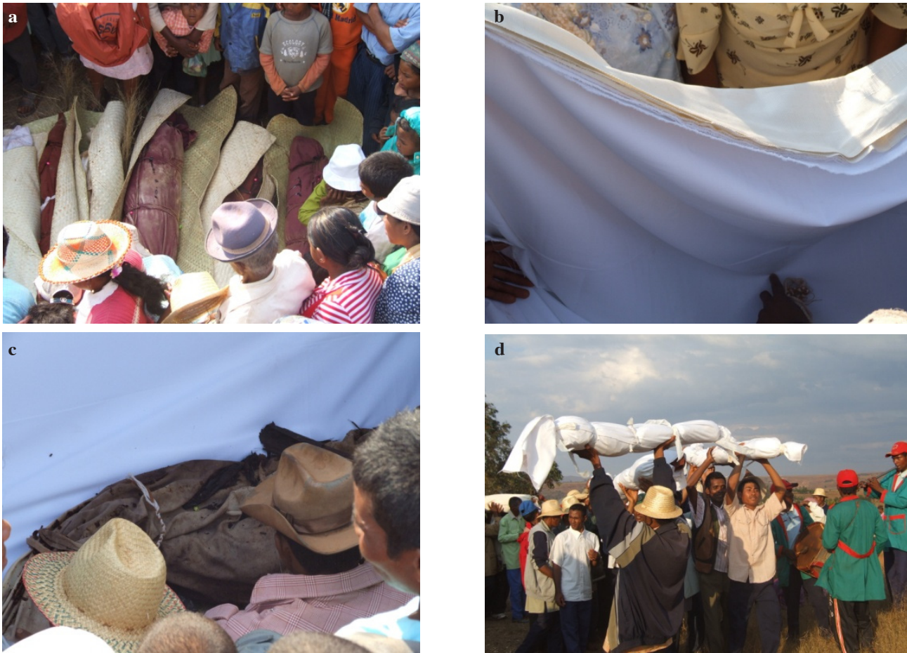
Figure 5. Wrapping during the “Famadihana” in Arivonimamo, 2009 — Enveloppement de dépouilles mortelles pendant le « Famadihana » à Arivonimamo, 2009.

a: mortal remains out of the grave — dépouilles mortelles exhumées ; b: shroud made by Bombyx mori — linceul fait à partir de Bombyx mori ; c: wrapping — enveloppement ; d: dance with mortal remains wrapped in silk shrouds — danse avec les dépouilles mortelles placées dans les linceuls en soie.