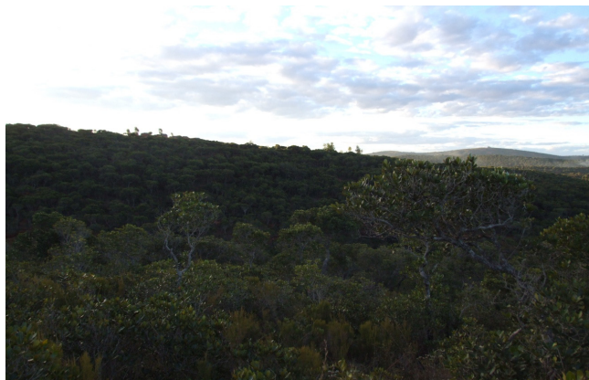
Figure 4. Uapaca bojeri forest in Arivonimamo, 2009 — Forêt de Uapaca bojeri à Arivonimamo, 2009.

zones (Imamo, Itremo) and Isalo zones of southwest of Madagascar (Gade, 1985). The “Tapia” forest constitutes one of the naturally formed forests of the island, primarily containing just one tree species, U. bojeri (Rakotoarivelo, 1993; figure 4 ). This plant