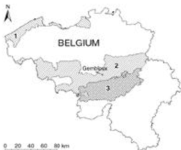
Figure 1. Location of the long term experiments (Gembloux) and the three agricultural regions — Situation des essais permanents de Gembloux et des trois régions agricoles : 1 = Dunes-Polders, 2 = Loam belt — région limoneuse , 3 = Condroz.

Farm yard manure and slurry production were calculated according to the methodology proposed by Dendoncker et al. (2004). These authors estimate the annual production of either FYM or slurry using the livestock in age classes, the type of housing, the time spent in the housing and excretion coefficients published by the Walloon Government (AGW, 2002). Farm yard manure and slurry inputs were then converted to carbon stocks using a dry matter content of 25% for FYM and 12% for slurry (Vlaamse Landmaatschappij, 2004) and a carbon content of 41% for both (Brady, Weil, 1996). We assume that FYM