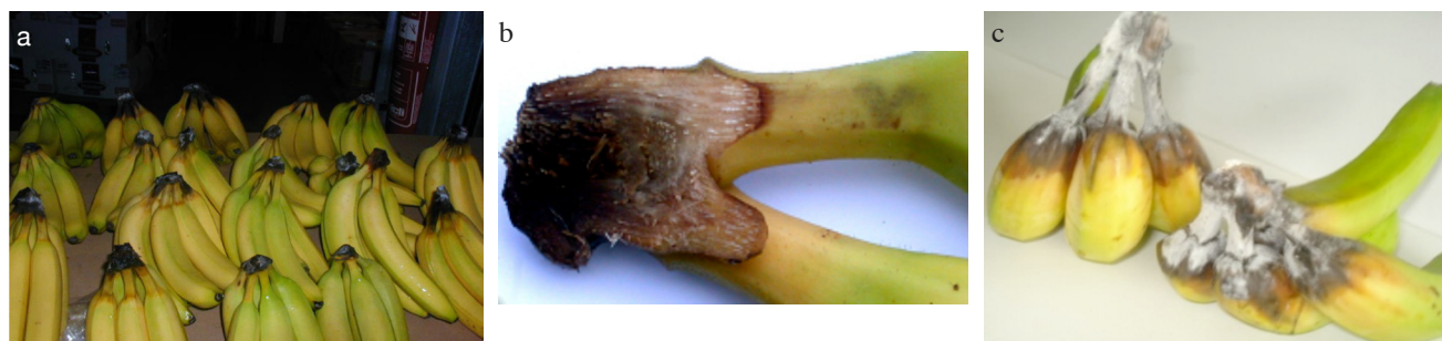
Figure 1. Banana crown rot — La pourriture de couronne des bananes.

a: necrosed fruit clusters — bouquets de fruits nécrosés ; b: internal necrosis — nécrose interne ; c: necrosis spread to peduncles and fingers — progression de la nécrose sur les pédoncules et les doigts.