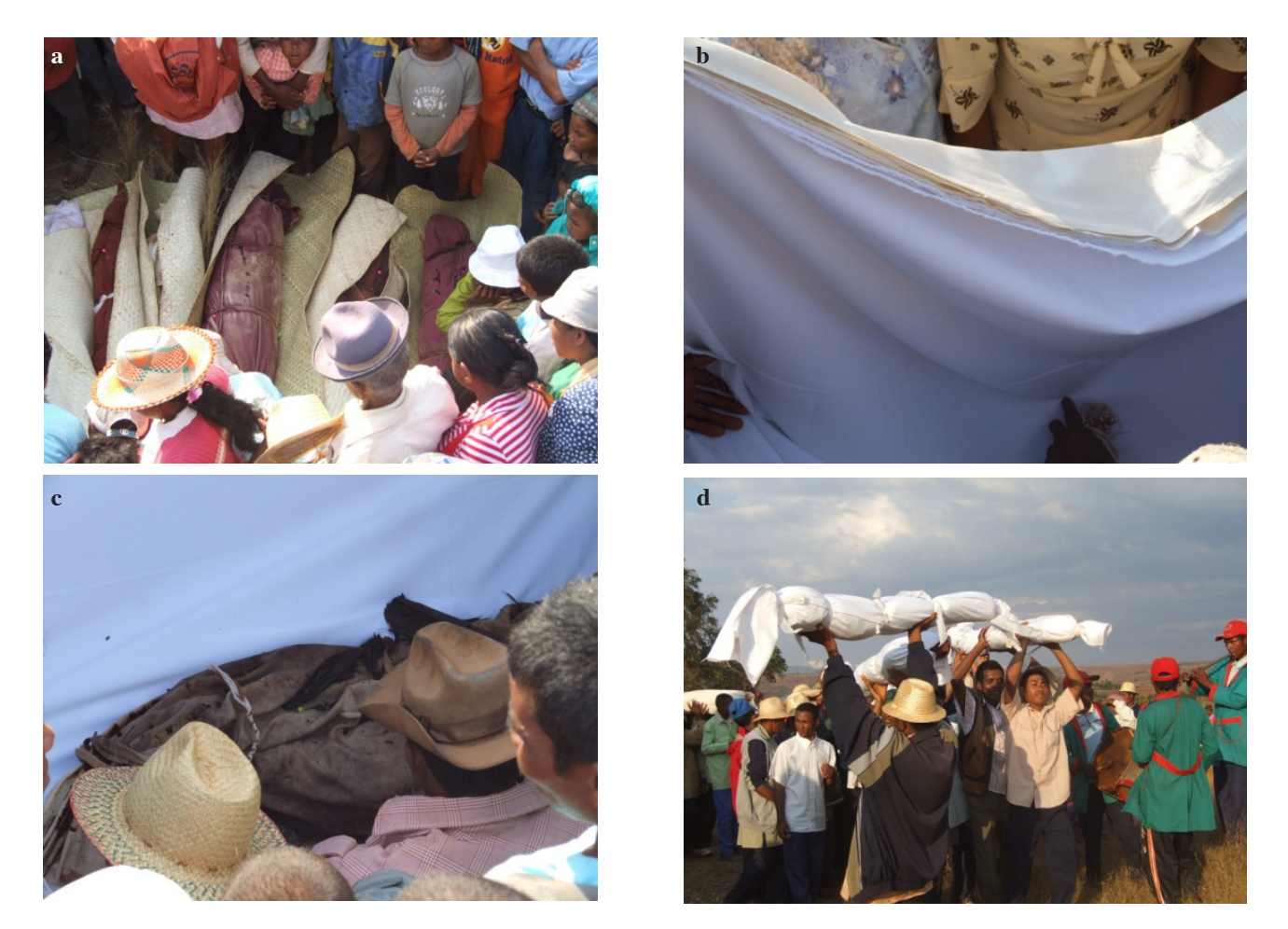
Figure 5. Wrapping during the "Famadihana" in Arivonimamo, 2009 — Enveloppement de dépouilles mortelles pendant le « Famadihana » à Arivonimamo , 2009.

a: mortal remains out of the grave — dépouilles mortelles exhumées ; b: shroud made by Bombyx mori — linceul fait à partir de Bombyx mori; c: wrapping — enveloppement ; d: dance with mortal remains wrapped in silk shrouds — danse avec les dépouilles mortelles placées dans les linceuls en soie .