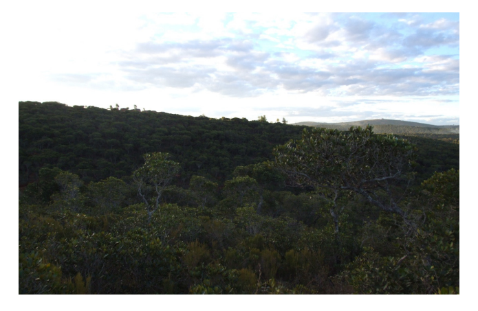
Figure 4. Uapaca bojeri forest in Arivonimamo, 2009 – Forêt de Uapaca bojeri à Arivonimamo, 2009.

zones (Imamo, Itremo) and Isalo zones of southwest of Madagascar (Gade, 1985). The "Tapia" forest constitutes one of the naturally formed forests of the island, primarily containing just one tree species, U. bojeri (Rakotoarivelo, 1993; figure 4 ). This plant