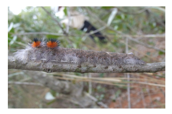
Figure 2. Borocera cajani larvae in 5th instar – Larve de stade 5 de Borocera cajani.

Borocera cajani colonizes the U. bojeri (or "Tapia") forest, which is found in the central highland