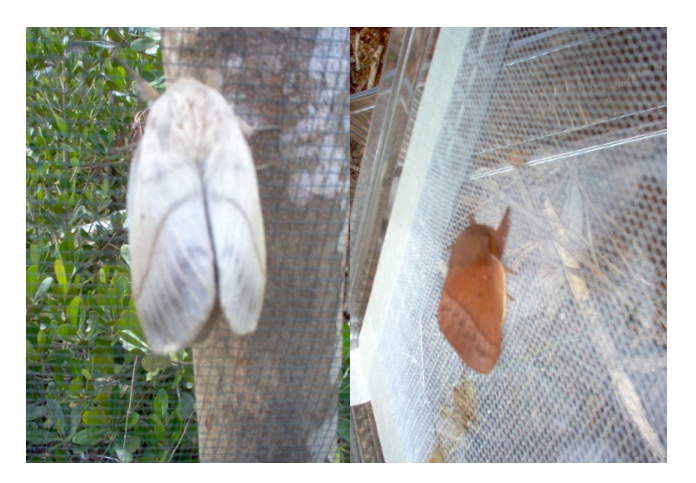
Figure 1. Borocera cajani moths (left: female, right: male) — Papillon de Borocera cajani (à gauche : femelle, à droite : mâle).

Females are much larger; with a body size about three times that of the male. Their wingspan is about 70-75 mm, with a forewing length of 35 mm. The antennal shaft is black, with yellow pectination. These moths are hairy, with a thick bodied, grayish yellow tinted, bare thorax, and legs of the same color as the forewings. The hairy legs terminate in black tarsi. The wings are a dirty white to pale grey, silky, and shiny (De Lajonquière, 1972; Razafindraleva, 2001). The forewings are crossed by two transverse lines that spilt