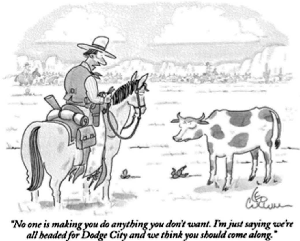
Figure 4: "No one is making you do anything you don't want. I'm just saying we're all headed for Dodge City and we think you should come along"