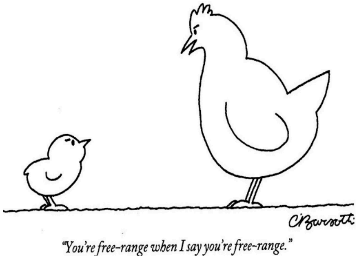
Figure 1: "You're free-range when I say you're free-range"

hand, means that someone older pays attention and responds to the child's needs and wishes, he has an effect on others, his social position and power is elevated, again, from an early age. In the dominant society children are granted an enormous amount of the second kind of agency but little of the first. For the village children typically studied by anthropologists, the situation is reversed (Lancy 2009).