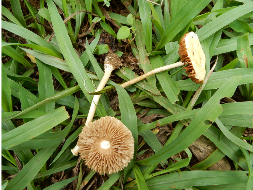
Figure 3: Agrocybe broadwayi , 16/04/2016 (YIAN172).