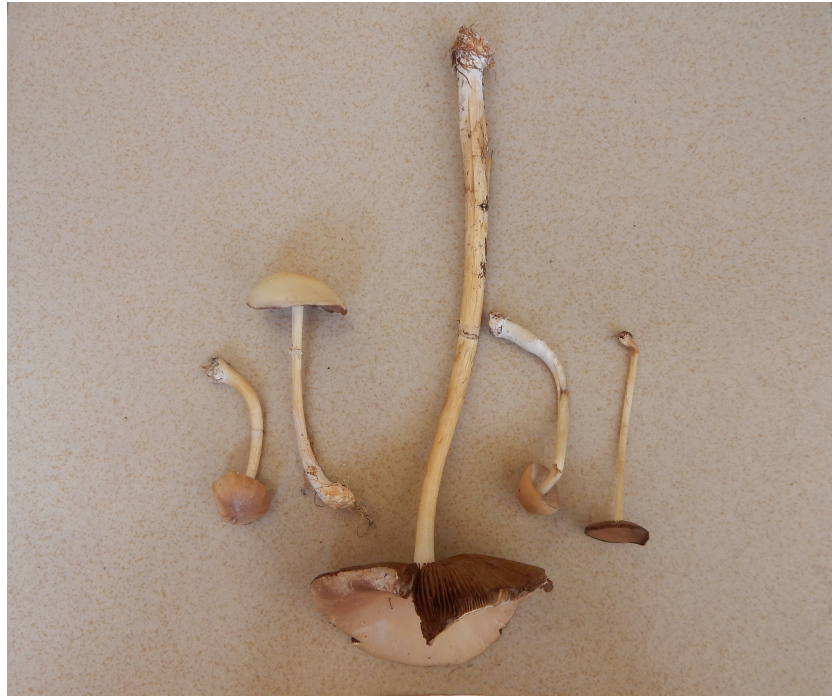
Figure 1: Agrocybe elegantior , Sikensi; 31/10/2014 (YIAN077).