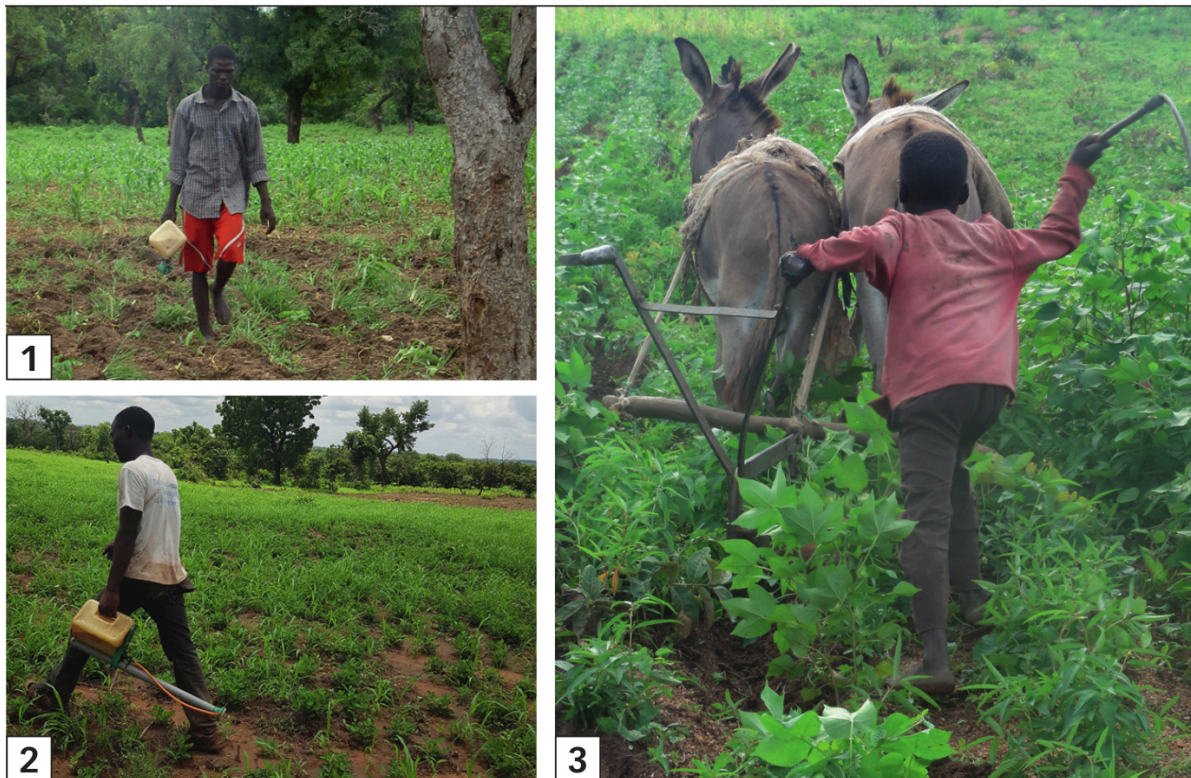
In Cameroon. Herbicide applications by Handy (1 and 2). 1. Post-sowing on maize after animal-drawn, rough ploughing. 2. Post-emergence graminicide on groundnuts. 3 . Cotton ridging