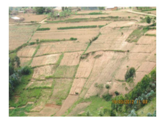
Figure 2. Fields on a steep slope with infiltration ditches and grass verges parallel to contour lines for erosion control — Champs sur forte pente avec fossés d'infiltration et bandes enherbées parallèles aux courbes de niveau pour lutter contre l'érosion.

Infiltration ditches. One of the most ancient and common examples of erosion control infrastructure in Rwanda is in the use of infiltration ditches ( imingoti ) stabilized by grass verges parallel to contour lines ( Figure 2 ). In addition to being labor-intensive and lacking positive impacts on crop yields, the method is inefficient in controlling soil erosion on steep slopes. In fact, the ditches do not have any impact on tillage practices (the root cause of human-induced erosion) or