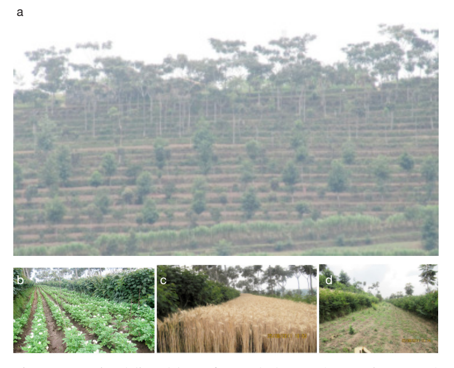
Figure 5. Kanyirandoli model: agroforestry hedgerows (progressive terraces) on acid soils with high input system (lime + manure + fertilizers) — Modèle Kanyirandoli : haies vives agroforestières (terrasses progressives) sur sols acides avec système d'intrants intensifs (chaux + fumier + engrais minéral).

In this context, more recently, with agroforestry hedgerows on contour lines, at the Kanyirandoli RAB Research Station, the combination of lime/travertine + manure + fertilizers on extremely acid and inherently poor oxisols has generated spectacular crop yields ( Figure 5 ). However, the adoption of the Kanyiradoli model has not yet become widespread. The frequently given explanation is that such an agroforestry system is a knowledge-demanding, labor-intensive and high investment technology (Drechsel et al., 1996). This means that designing an on-site experimental