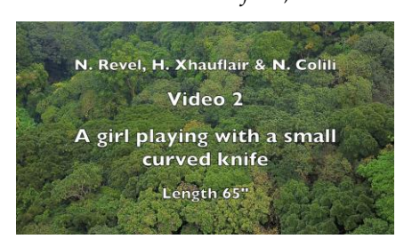
Video 2: A girl playing with a small curved knife (length 65"), © Hermine Xhauflair, 2017

<a href="https://youtu.be/kIa0h44IJZI">https://youtu.be/kIa0h44IJZI</a>