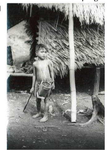
Plate 3: känakan helping in daily life tasks

damisil. All this is a delight and shall be cooked and shared on the spot. But there are also bigger snails in the forest – patung balay, patung kälaq, patung buku, patung