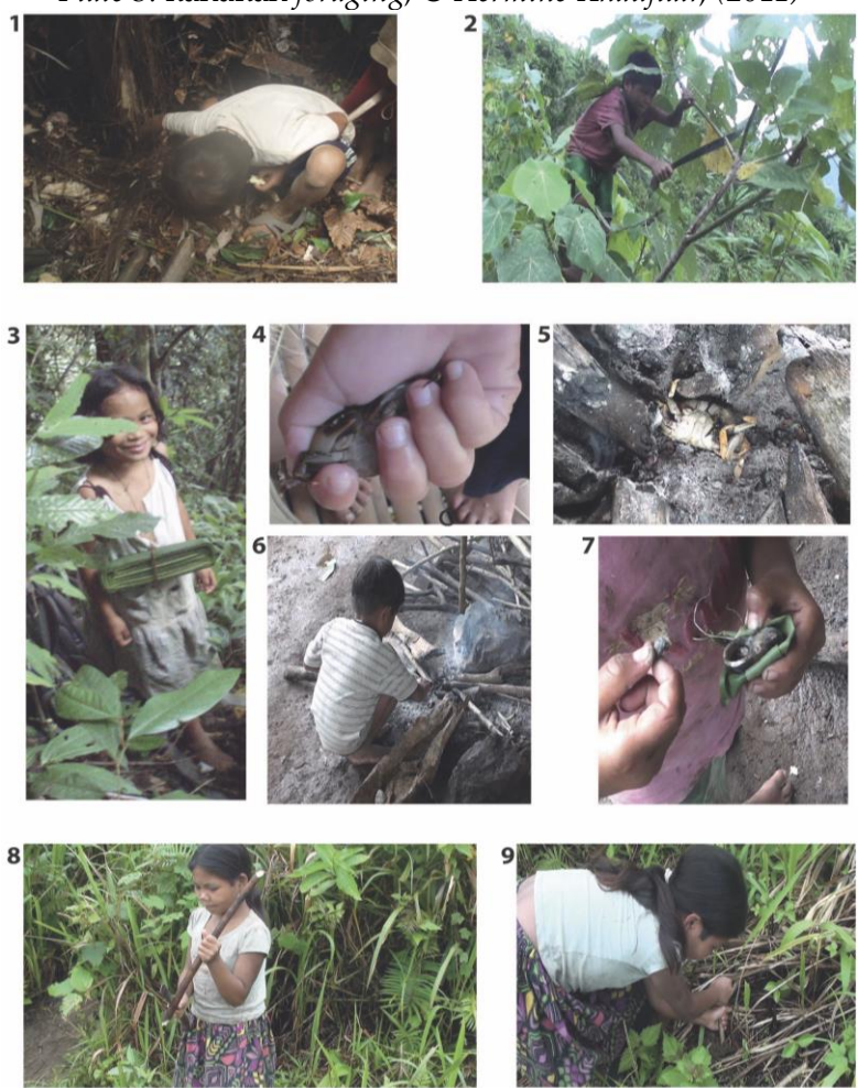
Plate 5: känakan foraging, © Hermine Xhauflair, (2011)