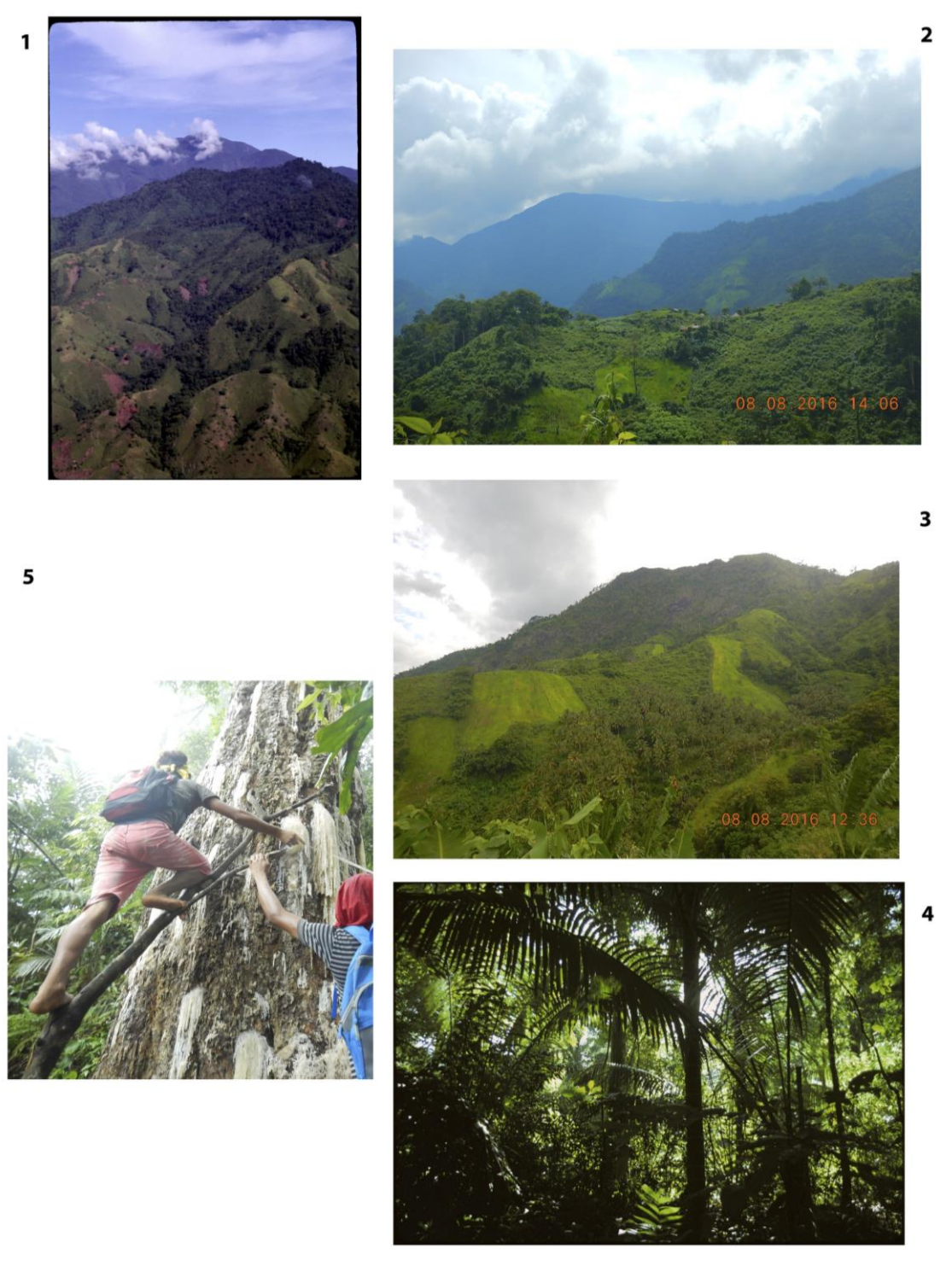
Plate 1: Photos of landscape, © Nicole Revel (1972, 1988) and Norlita Colili (2016)