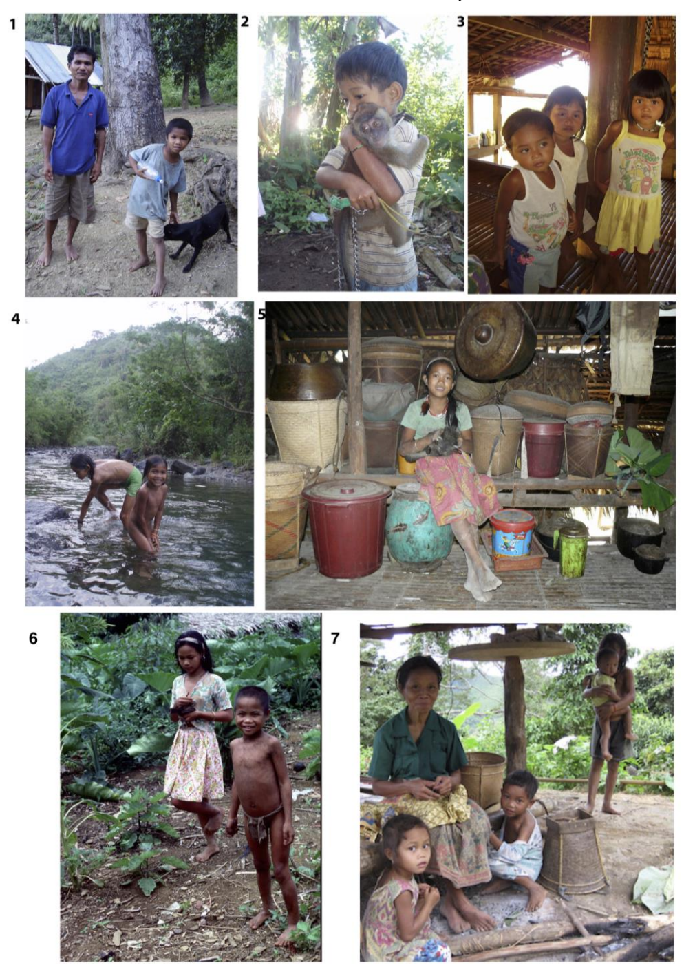
Plate 4: Känakan leisure and pets ayam