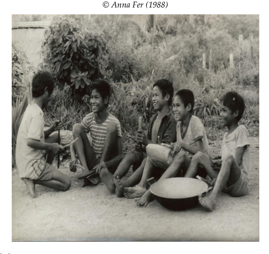
Plate 8: känakan playing gongs with machetes and cooking pot covers Basal ät takäp ät kandiru on the way to felling trees to open a new upland field,

their know-how, instead of dispising it, neglecting it or erasing it. May the Commemoration of the Master of Rice Tamwäy ät Ämpuq ät Paräy and the Commemoration of the Master of Flowers Tamwäy ät Ämpuq ät Burak , relating nature to their knowledge and artistic symbolic ritual expressions, not be abandoned ( cf. Plate 8 below). May all the practices and memories related to staple food cultivation (rice, corn and tubers in association) and to foraging forest products not be forbidden by external laws, nor forgotten by the young generations, so that the way of life in the Highlands, together with the elementary schooling in the mother tongue, would contribute to interiorize an ancient knowledge to modernity and would facilitate the integration of the teenagers in today's global world (Revel 2013).