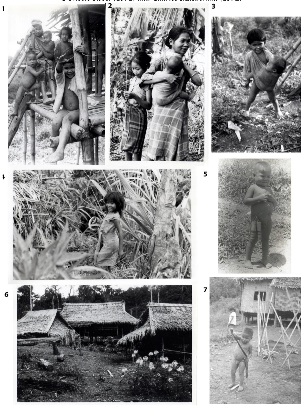
Plate 2: känakan in the house' surroundings lägwas, © Nicole Revel (1972) and Charles Macdonald (1972)